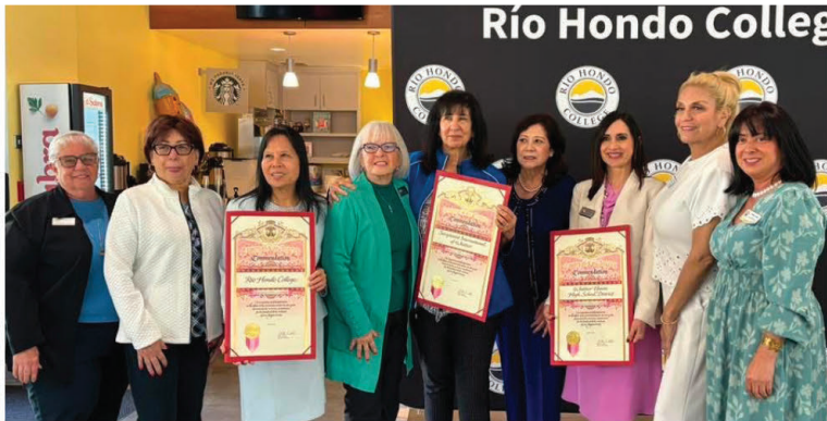
Keynote speaker L.A. County Supervisor Hilda L. Solis highlights opportunities for education and career pathways during milestone conference.

Río Hondo College welcomed students from the Whittier Union High School District to campus on March 6, for the 30th Annual Women's History Conference, an annual event dedicated to inspiring and empowering young women through education and community building.