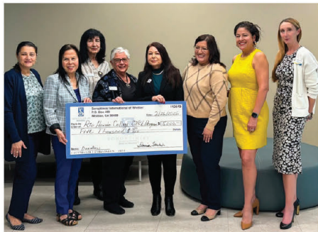
Rio Hondo CARE $5000 presentation