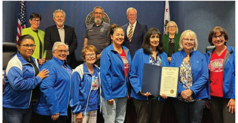
Recognition by Whittier City Council in honor of Women's History Month