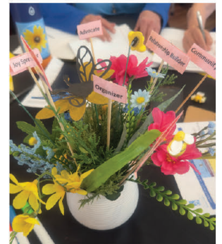
The District 1 Meeting was held March 7, hosted by SI Fullerton.