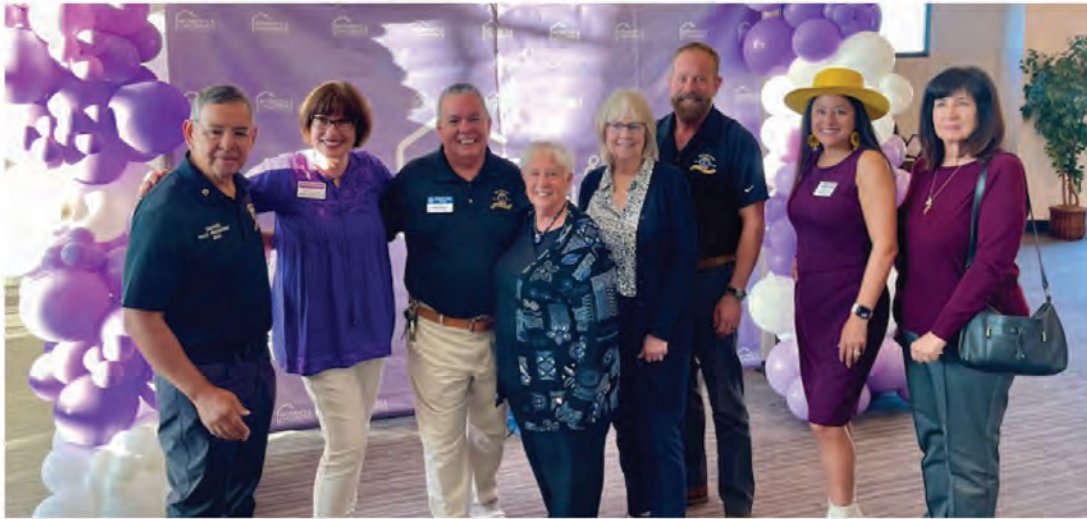
Women's and Children's Crisis Shelter Symposium, October 24th SIW provided an Impact Sponsorship for this event