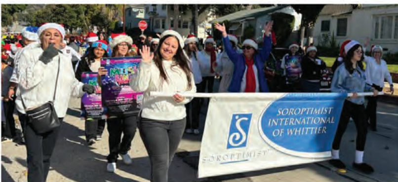
Uptown Whittier Annual Christmas Parade, December 14th