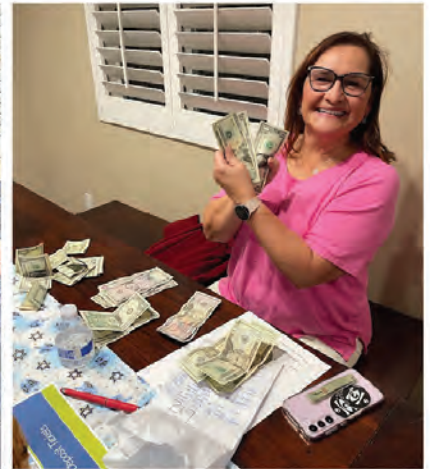
Fines Committee Club Christmas Party, December 17th