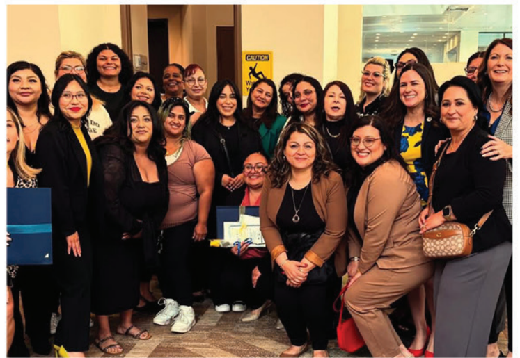
Rio Hondo CARE students with college president and faculty.

Heartiest of Congratulations to all the awardees. And an outpouring of Gratitude to all our sponsors and donors who gave of their time and resources in support of this, the reason for what we, as members and friends, do to support our mission for women and girls in our community throughout the year.