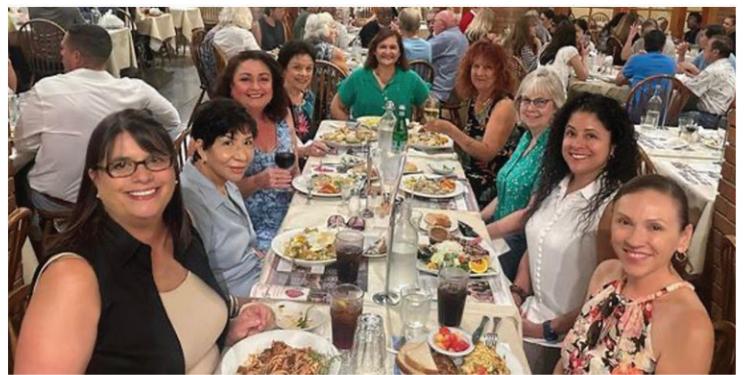
Field trip to San Antonio Winery