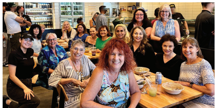
Cava Restaurant at The Groves