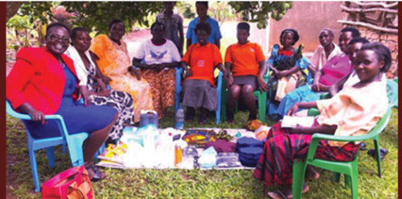
10 DECEMBER - LUGARI YOUTH TRAINING ON THE ROAD TO EQUALITY

Following is a summary of the Youth Training Camp, as posted under "SI President's Appeal" a few years ago.